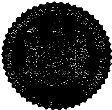
State Bank Commissioner

Issued under my hand and seal, this day, October 31, 2008, in Dover, Delaware.